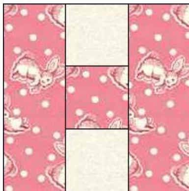
9" Finished Block

If you are a beginner, then this is the quilt for you! If you are an experienced quilter then this is one of those quilt in a weekend type quilts!